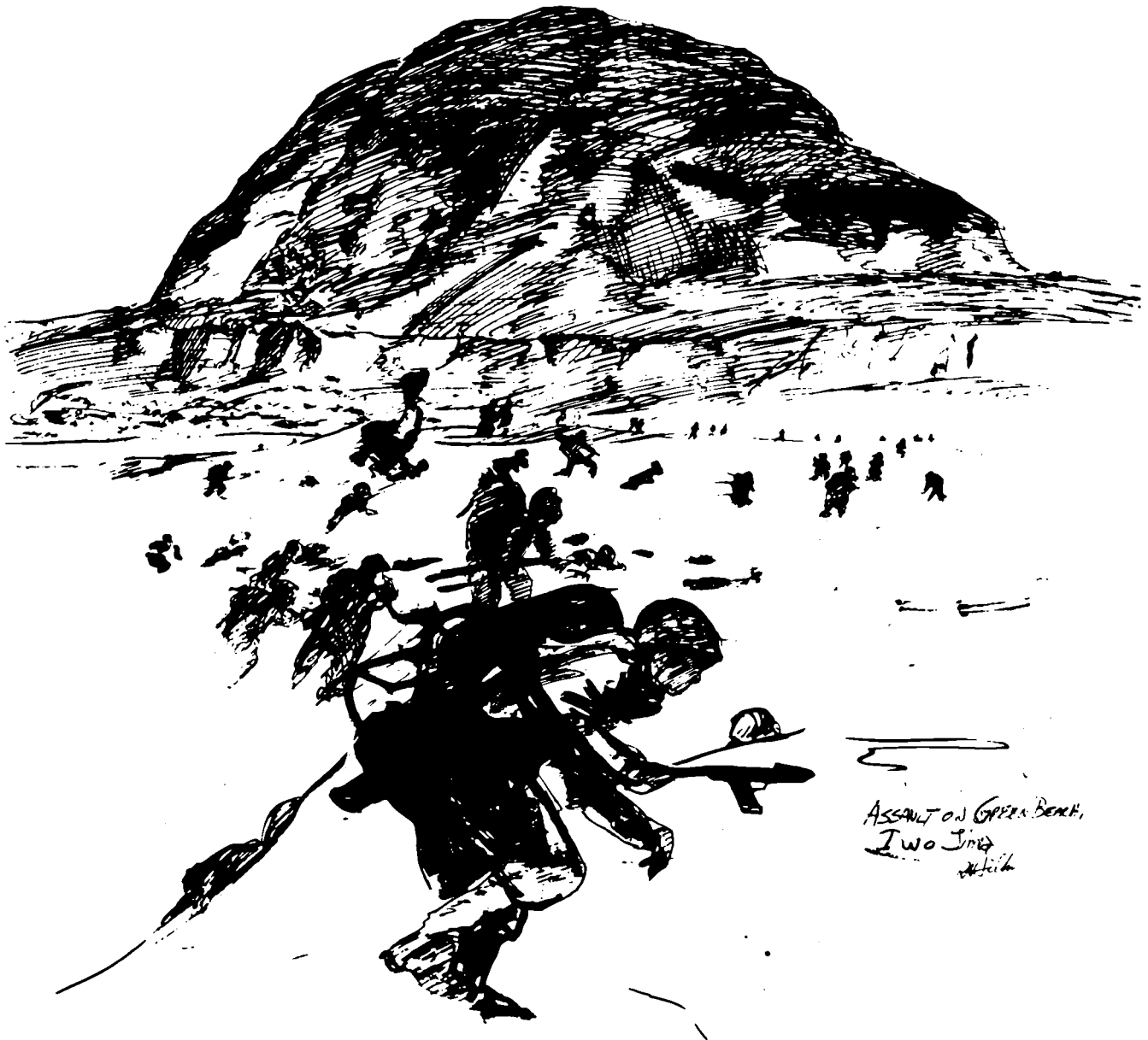
ASSAULT ON GREEN BEACH, Iwo Jima 1945

DISTRIBUTION STATEMENT A: Approved for public release; distribution is unlimited.